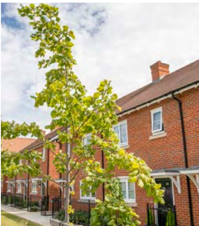
Grainger also manage 104 homes to rent at Berewood