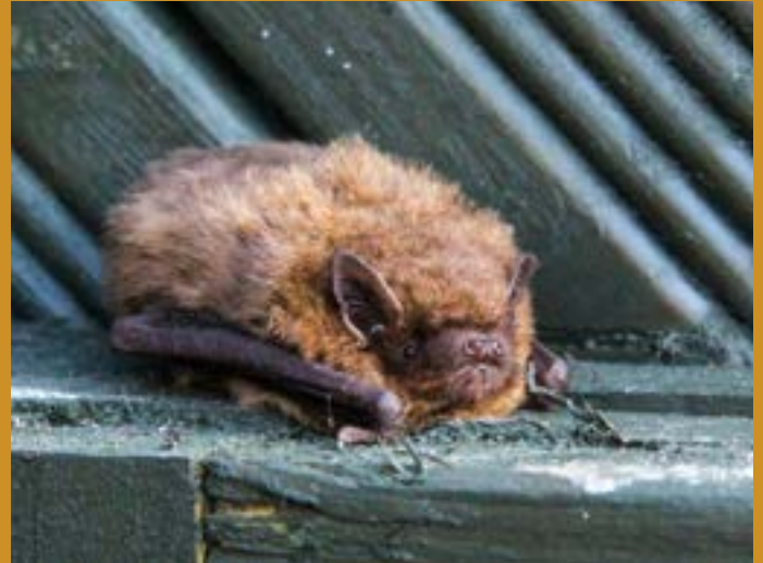
Common Pipistrelle Bat

Under 18s must be accompanied by an adult